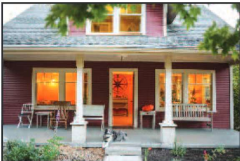
North Fork 53 Gardens & Retreat Center