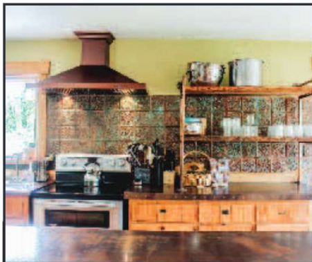
Kitchen at North Fork 53 Gardens & Retreat Center

About 15 minutes northeast of Manzanita, this Norman Rockwell-esque bed and breakfast is a lovingly restored 1930's farmhouse perched on the Nehalem